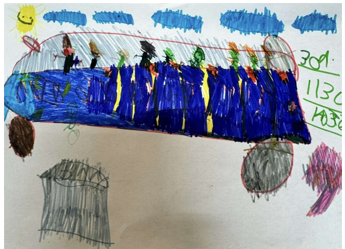
Bus trip to the library