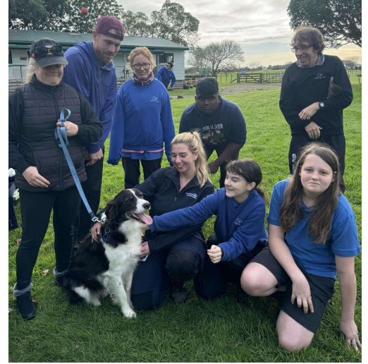
Blues and Vocs with Animal Safety Team

Vocational Programme (Vocs): The adult vocational/life skills programme also enables therapy riding and caring for the horses. Much of the programme's life skills activities involve work around the horses as well as cooking, domestic duties and gardening. They have cultivated an impressive garden and tend to our chicken flock. Community participation is a key part of their week that involves swimming, art at Māpura Studios, Library visits, using public transport, fun outings such as going to local plays, and exploring our surrounding whenua. They also give back to the community by setting up and taking down arena equipment for the Clevedon Pony Club's weekend eventing. Several key support workers assist with the Vocational programme. It is a wonderfully busy Centre where our dedicated staff ensure much positive work happens.