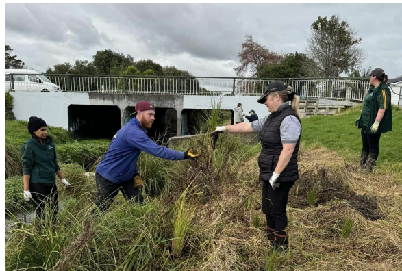
Vocs planting at Te Ara Rata Stream

On behalf of the board, I express deep gratitude to our community trusts, charitable trusts and the many donors for operations, horses and all sorts. We are also grateful to the whānau and agencies like Oranga Tamariki, Te Hikoi and ACES (AE) and Ministries for support. There is no doubt that Ambury Park Centre is unique both in what it offers and how skillfully it serves its therapy riders, secondary students and adult clients. I am extremely proud of Ambury Park Centre and having the pleasure of working with and being alongside its people - staff, board, whānau, supporting agencies and donating trusts, donors, and ministries that make Ambury an institution that helps improve lives. A very special thanks to all the staff who put in so much practical work to make this a reality.