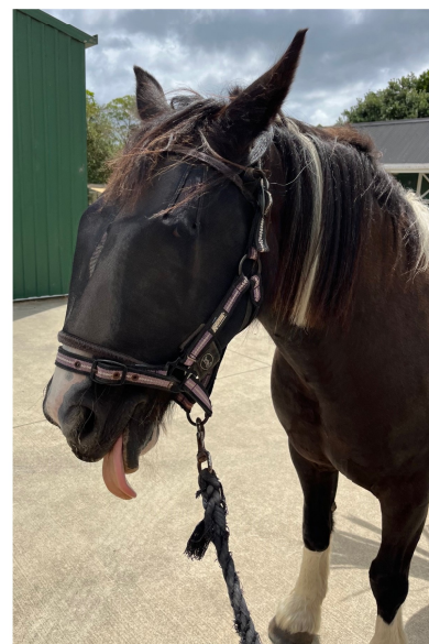
Mesh masks help protect our horses faces from UV light and infection