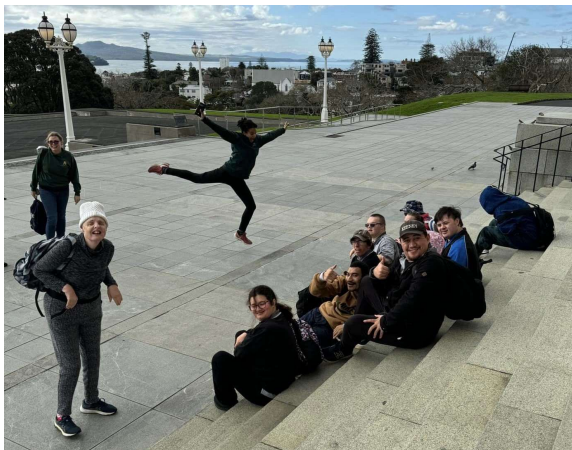
Vocs trip to the museum