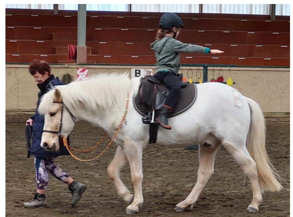
RDA Ride in action

RDA Programme: As mentioned the intensive riding therapy is minimal currently but normally operates for many clients, mainly children, with significant disabilities. Ambury's intensive therapy combines Riding therapy, Hippotherapy and Physiotherapy. The gait of the horse works on the muscles of human uprightness and along with hippotherapy is able to target specific parts of the body. The magic of this work and the relationship with the horse enable significant improvements in mobility, speech and other cognitive developments. In the remedial programme, the riders may graduate from Intensive or join the programme with less severe disabilities. They also present with issues such as neuro- divergence, depression, social anxiety and other mental health challenges. Again the riding therapy and the relationship with the horse work magic physically, socially, cognitively and psychologically. Improvements are noted by whanau, agencies and schools. Most importantly the sessions are fun!