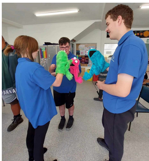
Students explore creativity and character-building with puppetry

The Blues had a fabulous start to 2024, enjoying the sunny weather. Families and students came in for working bees at the start of the term and worked incredibly hard to clean, tidy, and fix the classrooms, stables and grounds. We all really appreciated the refreshed Ambury spaces. Term 1 started off with student-Whānau planning meetings; it was great to catch up with everyone and the students settled into their academic learning with refreshed goals for the new year.