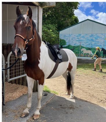
New boy Tama

The current Ambury herd stands at eighteen horses. Although we have fewer than usual, all our current horses are fit and in active work, and generally younger than in the past. This has allowed changes to fitness programmes, training and work load. Diversity of work and play helps keep our horses happy and healthy in mind and body. We suddenly have several paints and chestnuts, making identification in low light, at a distance or with covers on a fun experience!