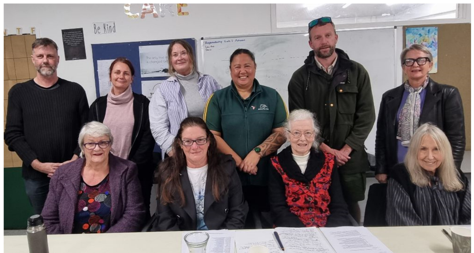
Ambury Park Centre AGM, June 2024

A note to our staff, thank you! Your commitment is the reason that we exist. It is the reason that the people we serve trust us and engage fully in the services that we provide. Thank you also to all of our volunteers for offering your time and expertise, we value you all.