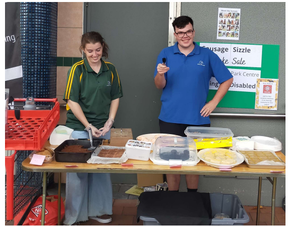
Successful sausage sizzle fundraiser